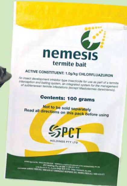
NEMESIS BAIT MATRIX