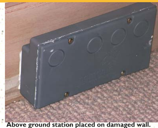
Above ground station placed on damaged wall.

The Nemesis Bait Matrix is particularly attractive to termites—they will feed on it in preference to the timber of your home. This means that if active termites are located within your home, baiting can commence immediately, using specially designed above-ground feeding stations which are strategically placed over the termite workings. The workers will rapidly accept the bait, taking it back to the nest and sharing it with the queen, soldiers & other workers. The termites cannot sense that the bait is affecting their ability to grow and develop. The active ingredient, Chlorfluazuron , is not only a proven insect growth regulator, it also stops the colony being able to reproduce effectively or successfully. The colony consequently loses whole generations of replacement members, it progressively declines and inevitably collapses. The effects of the Nemesis bait are visible and can be tracked. This means that the colony elimination can be reliably determined. The termites' natural habits, food preferences and feeding behaviour are all used to its disadvantage.