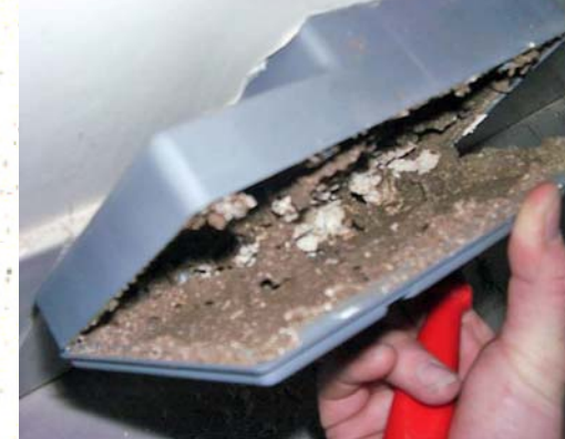
Above ground station with termite activity.