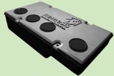
ABOVE GROUND STATION