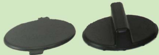
INGROUND STATION LID AND REMOVAL TOOL