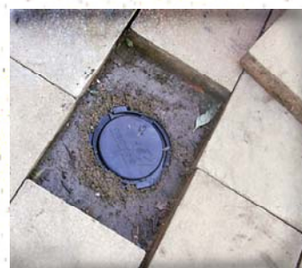
Installation under pavers

Nemesis in-ground stations are at the forefront of the System - affording your home ongoing protection from termite attack. These stations are placed strategically around the exterior of your home, either in soil, through concrete or under pavers where they become your first line of defence against possible termite attack. In fact, they can be placed at any area of risk on your property! Regular monitoring of these stations, at 8 to 12 week intervals, by a pest manager, allows for early detection of foraging termites. When activity is detected in these stations, Nemesis bait is introduced into the upper void of the station, where it is readily taken by the termites. It acts upon the colony in the same manner as for inside your home. Active stations are regularly inspected, at approximately 3 week intervals, and the bait is replenished or refreshed as required in order to facilitate continuing bait uptake by the termites. When the colony has been eliminated, the residual bait is removed, new timber inserts installed and regular inspections maintained thereafter.